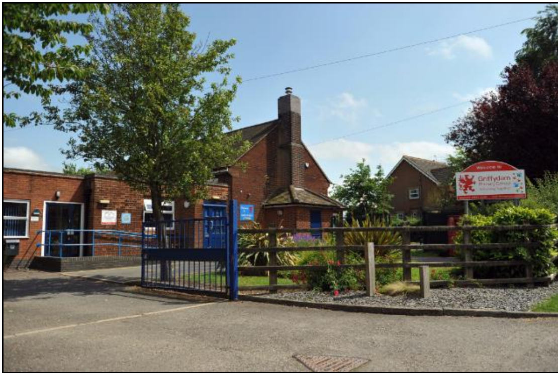
GRIFFYDAM PRIMARY SCHOOL TODAY