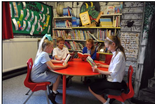
Photograph in Public Domain on website

Photograph taken during 2 nd W.W. - Note the Evacuee on the 3 rd row