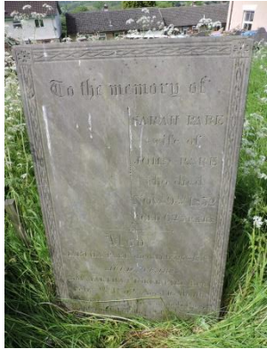
Swithland Slate Headstone