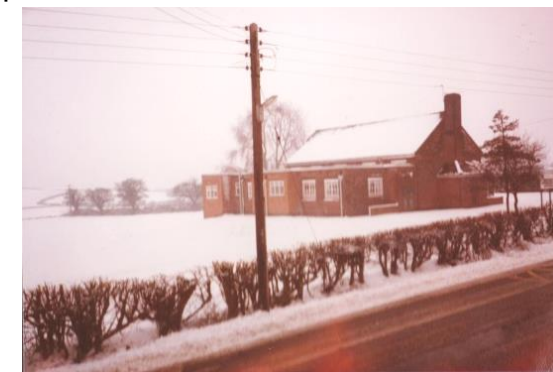
Griffydam School January 1982

Click here for further information about the school.